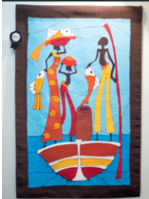
Eva Gustems A ran de mar