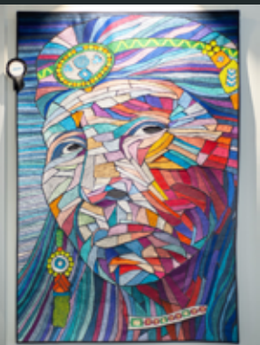
Isabel Muñoz Native woman