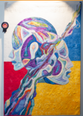
Sylwia Ignatowska Border